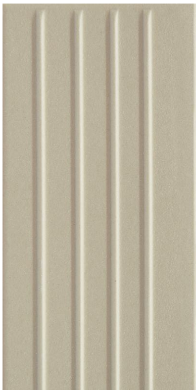
BONE NATURAL 107