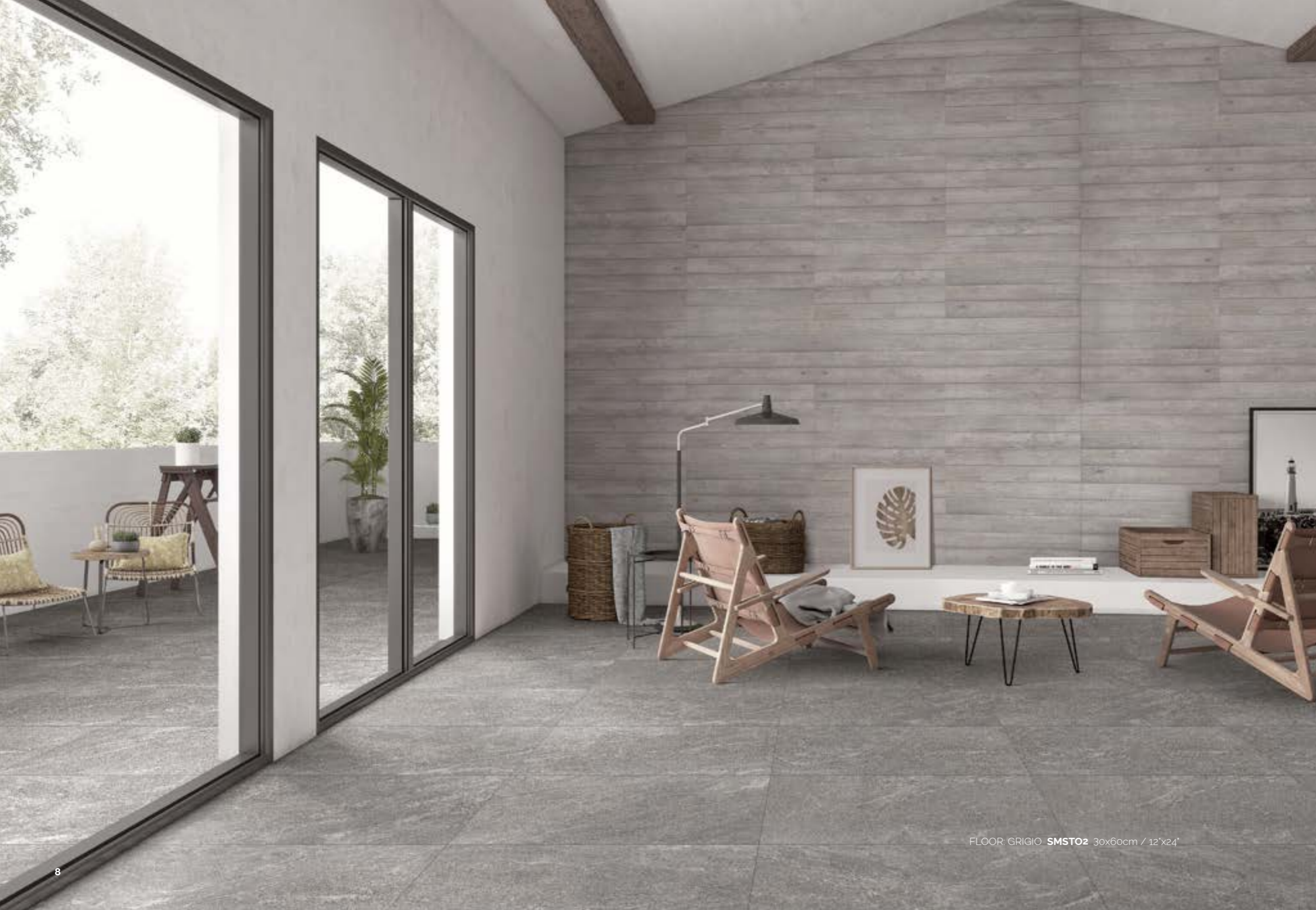
FLOOR: GRIGIO SMST02 30x60cm / 12"x24"