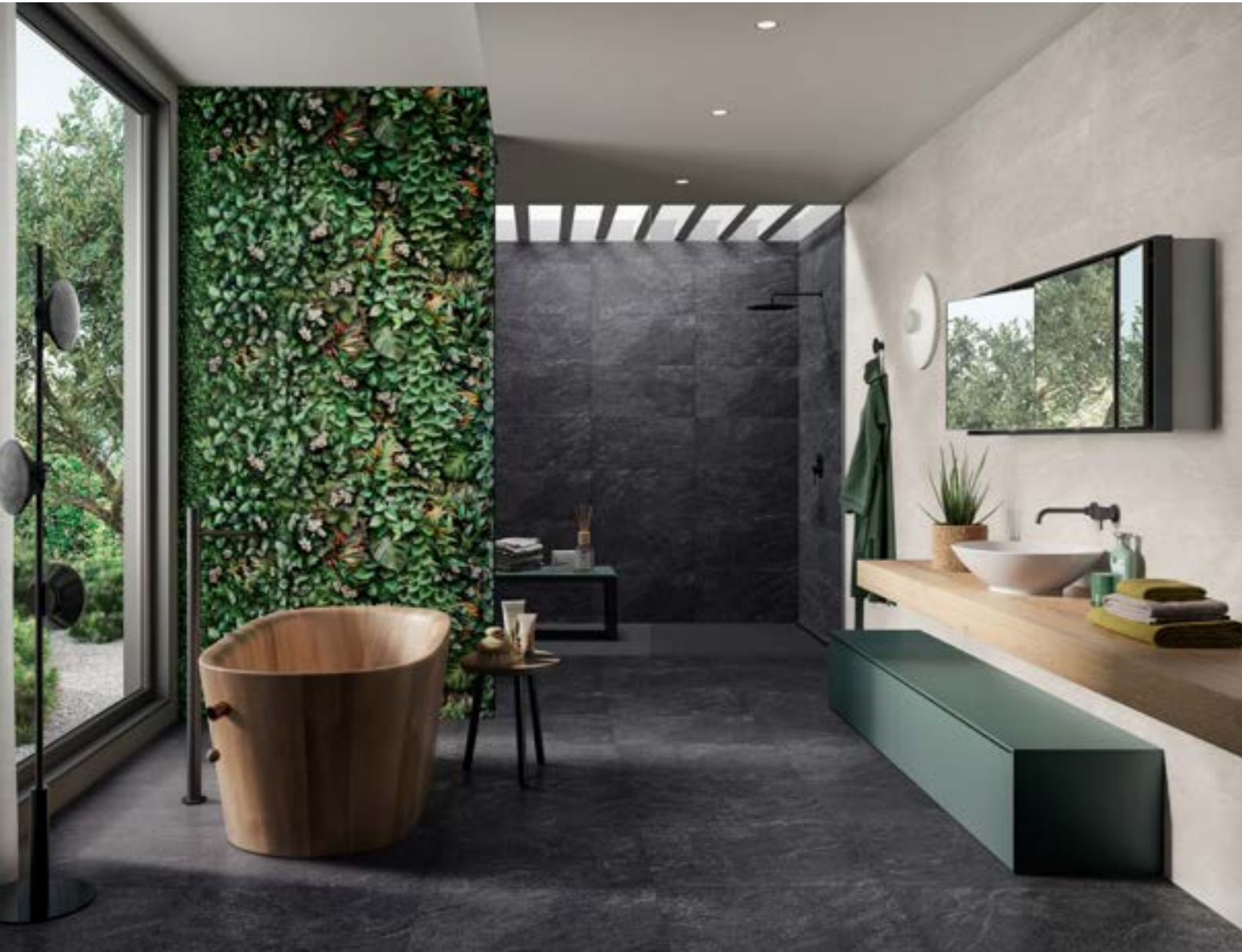
WALL&FLOOR: ANTRACITE SMSTO3 30x60cm / 12"x24" WALL: BIANCO SMSTO1 30x60cm / 12"x24"