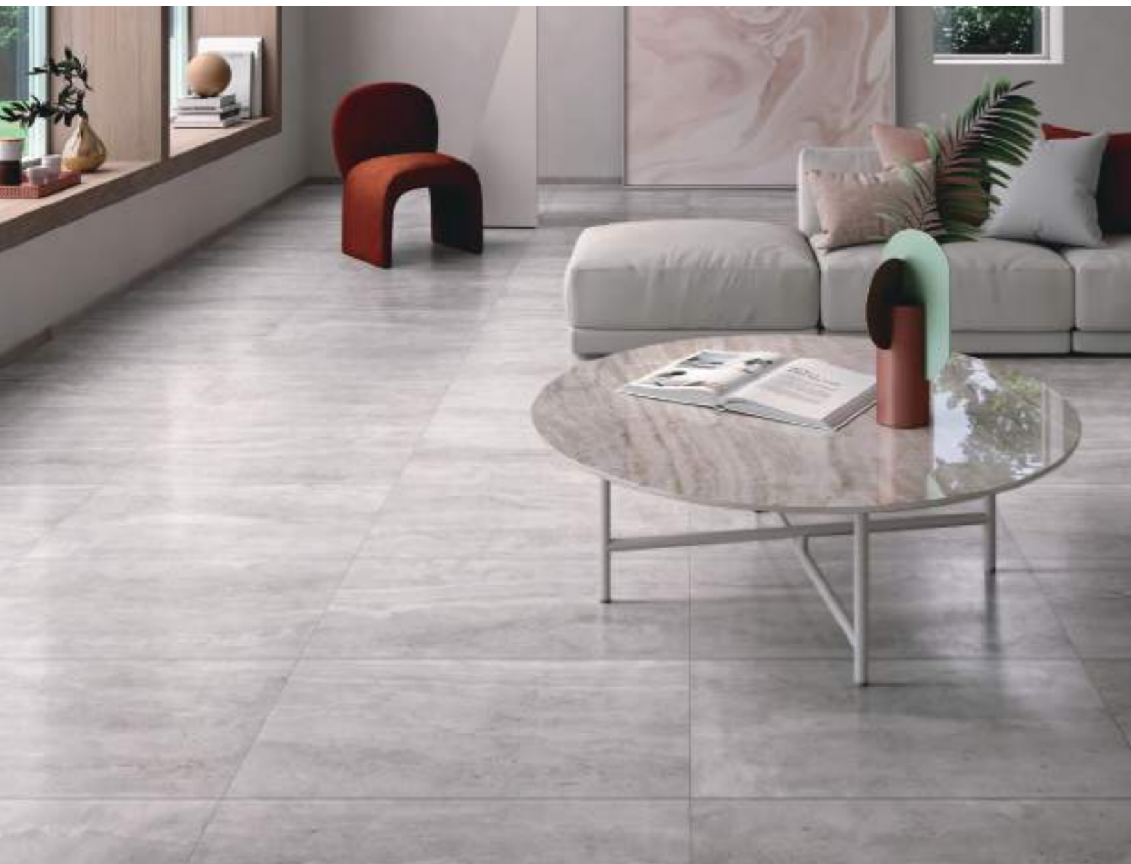
FLOOR: SILVER SMTRA3 30x60cm / 12"x24"

Epitomising the natural charm of travertine stone.