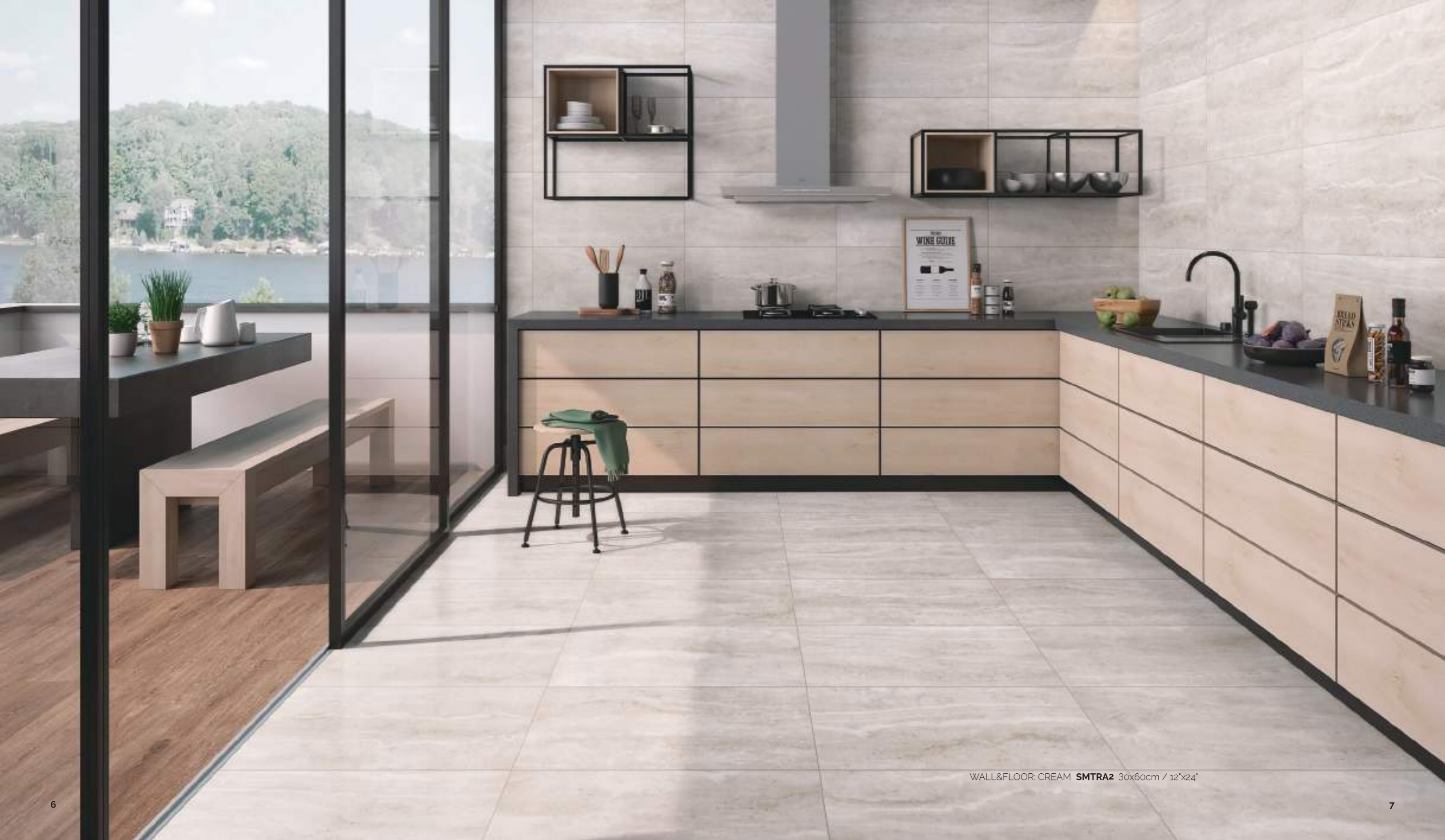
WALL&FLOOR: CREAM SMTRA2 30x60cm / 12"x24"