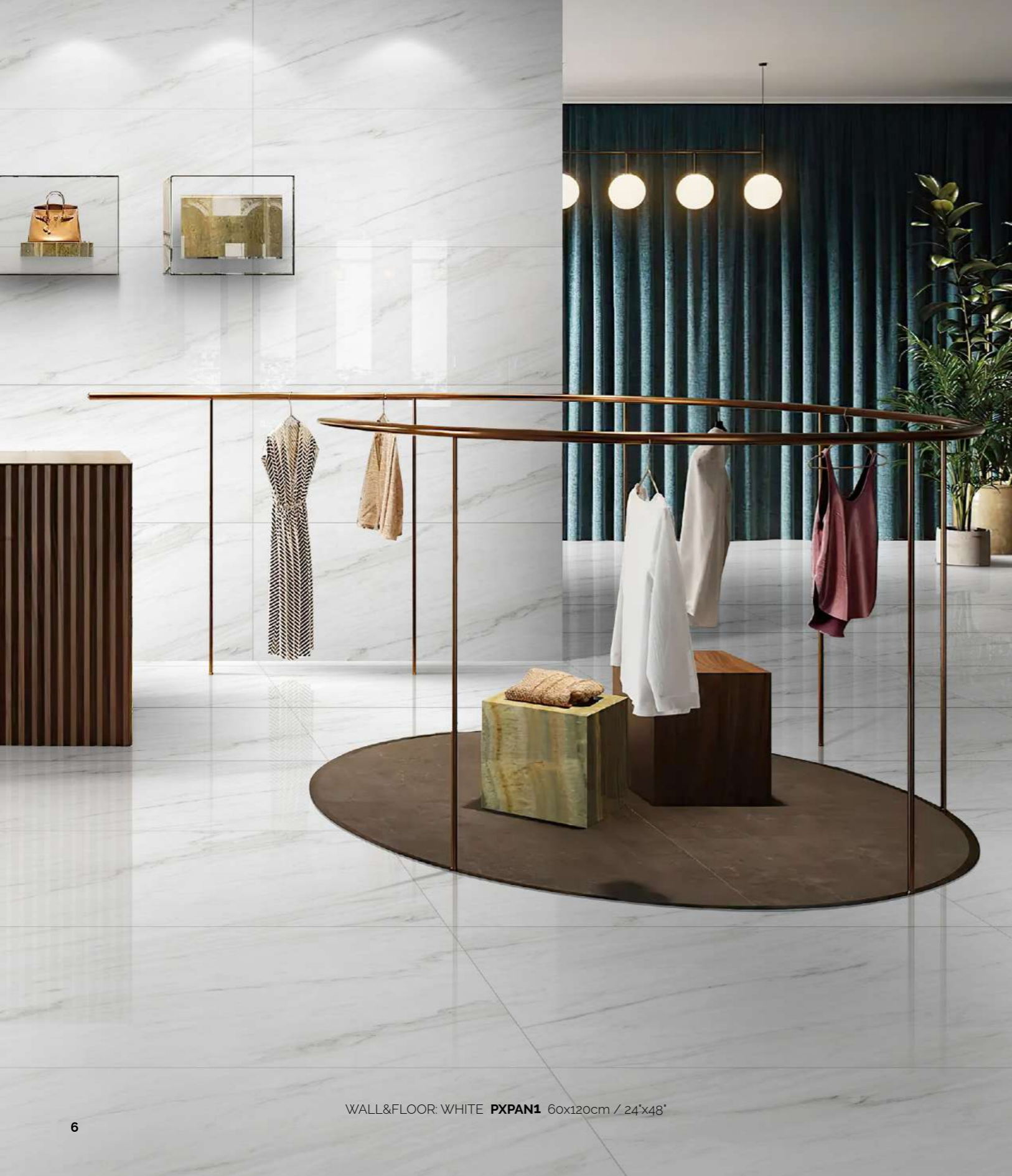
WALL&FLOOR: WHITE PXPAN1 60x120cm / 24"x48"