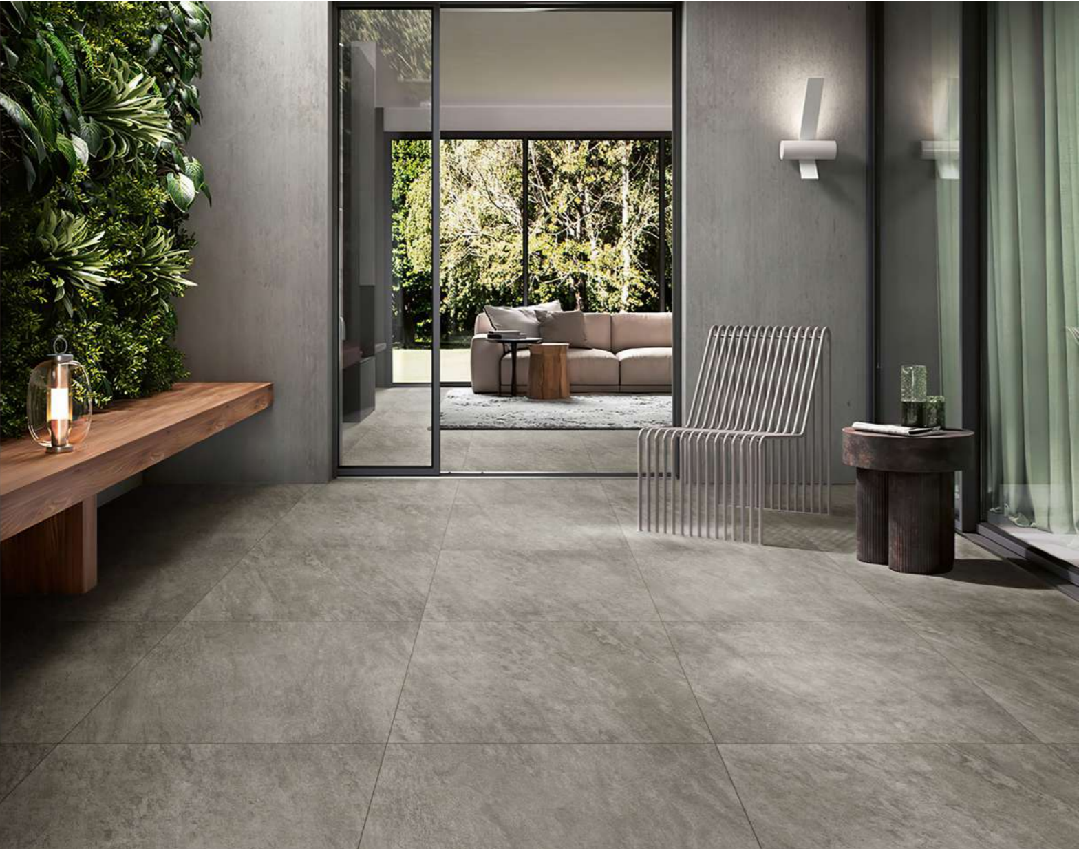
FLOOR: GRIGIO SCBRA2 60x60cm / 24"x24"