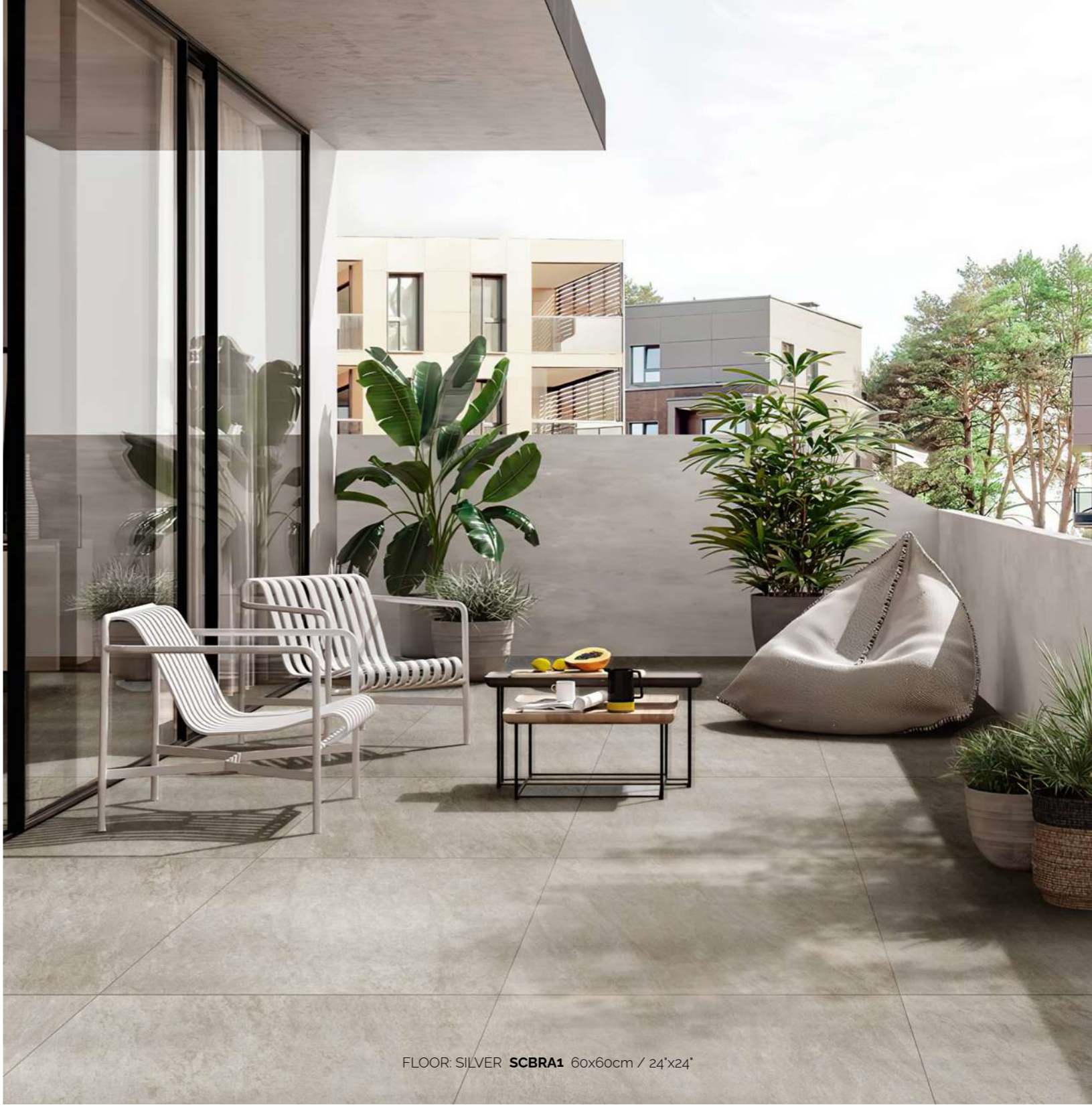
FLOOR: SILVER SCBRA1 60x60cm / 24"x24"