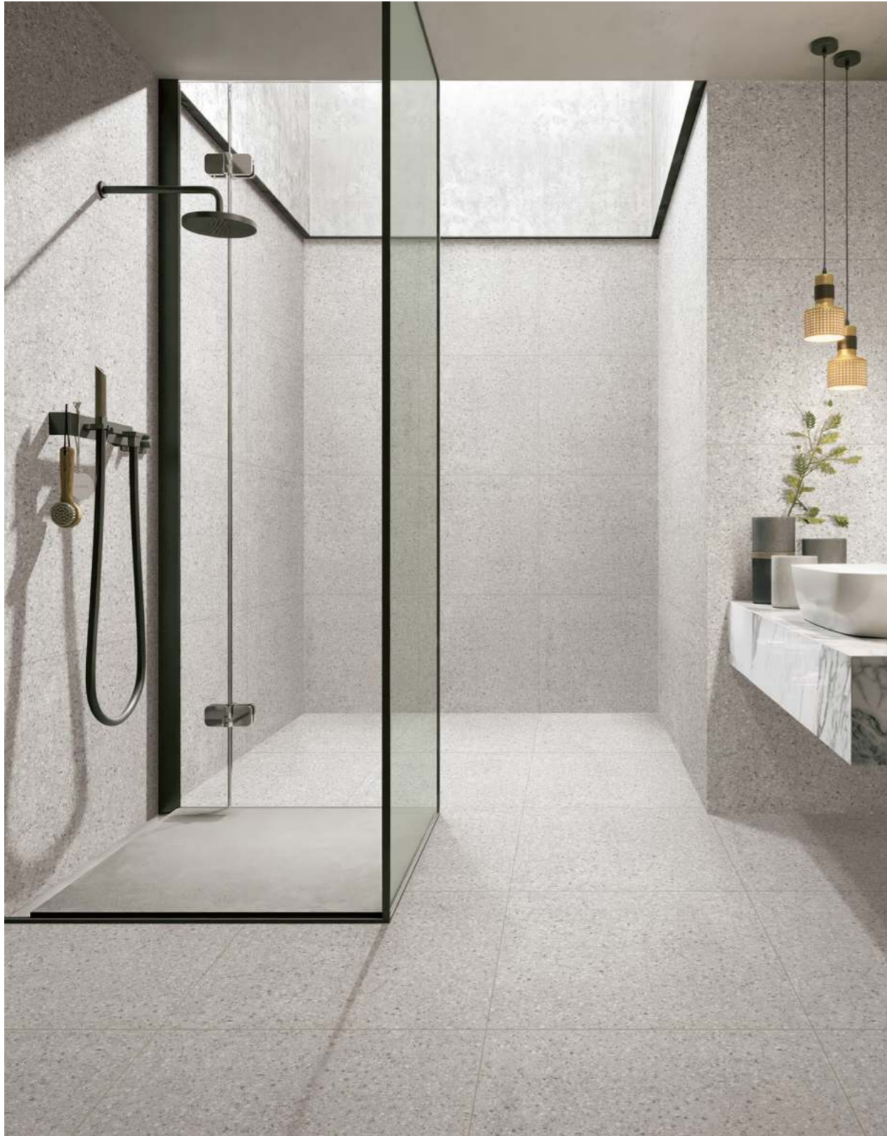
WALL & FLOOR: GREY SMTAN1 60x60cm / 24"x24"