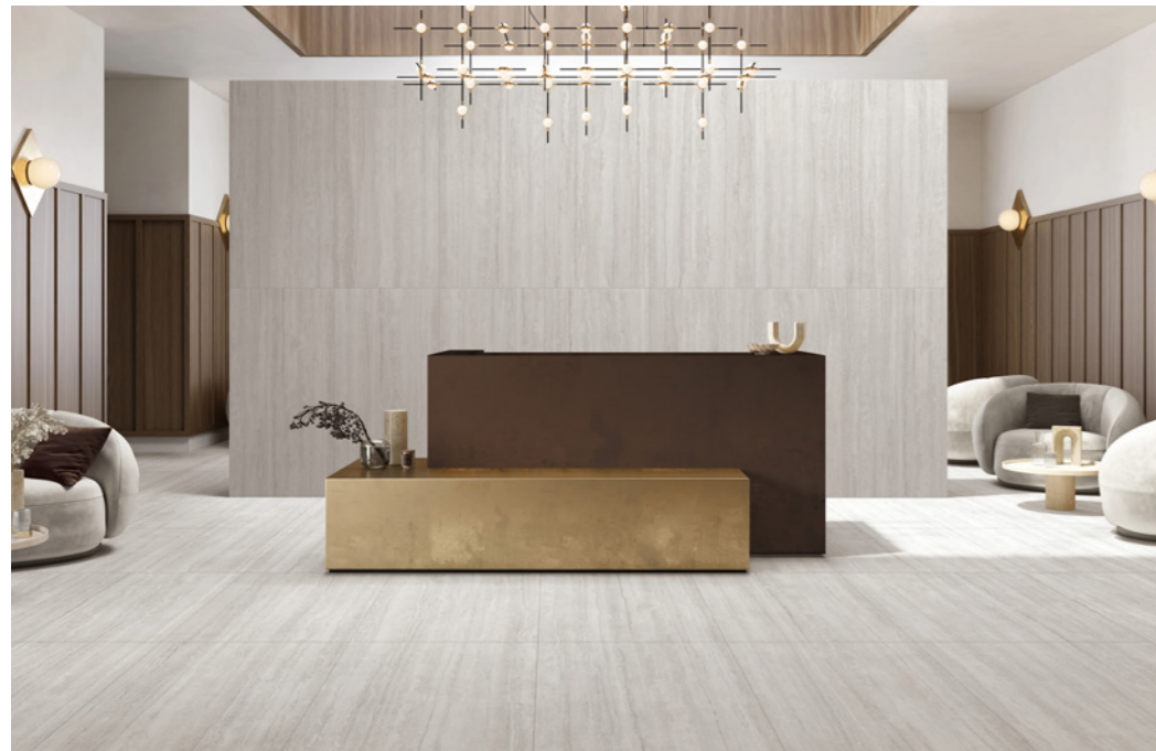
WALL: AVORIO PXTRA6 60x120cm / 24"x48" FLOOR: AVORIO SMTRA6 60x60cm / 24"x24"